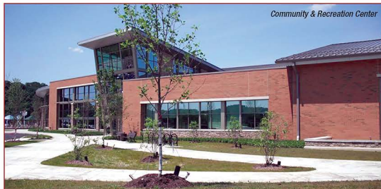
Community & Recreation Center

The Township has over 550 acres of community and neighborhood parks and facilities, including playgrounds, tennis courts, a three-hole golf course, baseball fields, basketball courts, soccer fields, walking trails in Gilfillan and Boyce Mayview Park, and more.