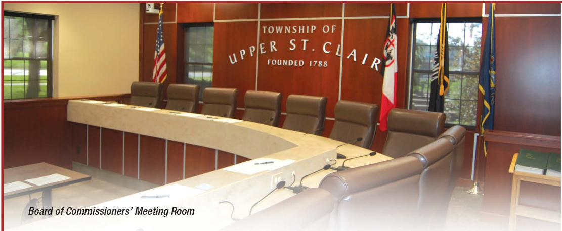
Board of Commissioners' Meeting Room