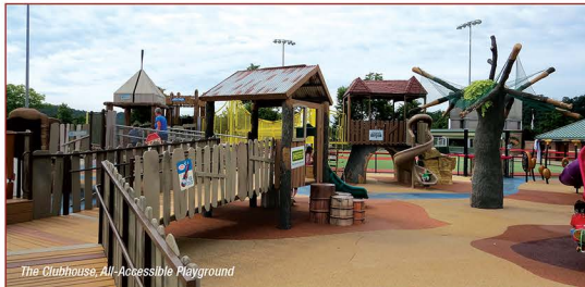
The Clubhouse, All-Accessible Playground

The Miracle League of the South Hills Field, aided by Casey's Clubhouse, many corporate and personal donations, including the Pirates Charities, opened in 2009. This active sports league has grown over the years offering every child a chance to play ball.