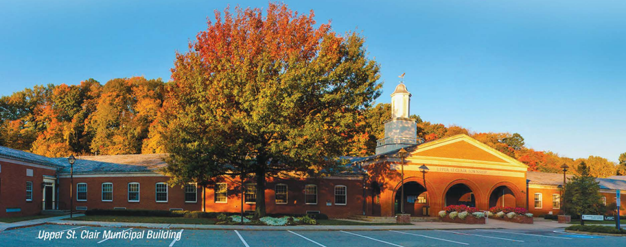
Upper St. Clair Municipal Building

Township of Upper St. Clair | 1820 McLaughlin Run Road | Upper St. Clair, PA 15241 PHONE: 412.831.9000 | www.twpusc.org