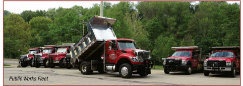
Public Works Fleet

The Public Works Department is responsible for the management and supervision of all activities relating to streets, storm sewers, sanitary sewers, trash collection, recycling, leaf and yard waste collections, parks and recreation facility maintenance, building and grounds maintenance, and forestry.