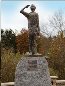
Veterans Park Statue